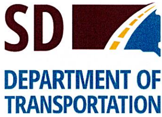
EXHIBIT A Division of Secretariat Office of the Secretary 700 E. Broadway Avenue Pierre, South Dakota 57501 605.773.5105 dot.sd.gov | sd511.org